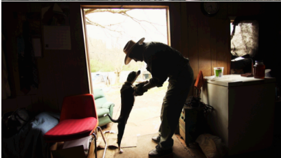
Top to bottom: Darius Rucker, Divided City , Alabama Bound , Gip .

February 9, 2018 — REEL SOUTH , the public television series showcasing documentaries rooted in the tradition of Southern storytelling, returns for its third season with compelling stories and unforgettable characters from Memphis and Austin, New Orleans and Birmingham, and the small towns in between. The series, a co-production of UNC-TV and SCETV, airs weekly on WORLD Channel on Sunday nights, March 11 through April 29, 2018, at 9:00 p.m. ET/6:00 p.m. PT.