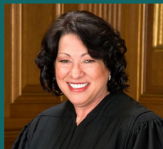
SONIA MARIA SOTOMAYER